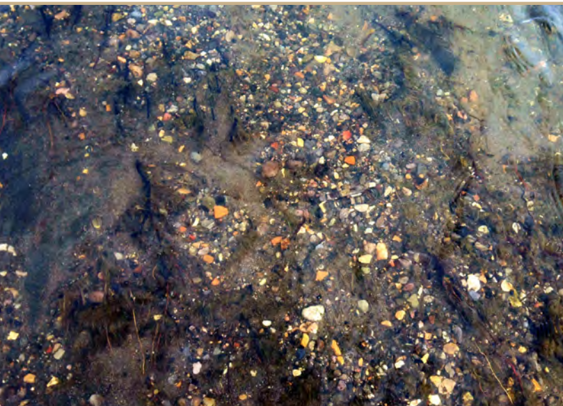
Macrophytes hold the key to wild trout habitat in the Ranch; they provide cover, produce oxygen, support invertebrates, and increase water depth. The photo above shows the Henry's Fork below Osborne Bridge in March 2014.