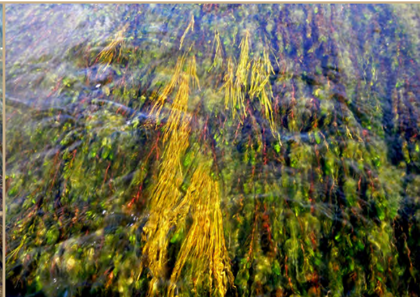
By fall, thick plant growth covers the same location. Photo above was taken during September 2011.