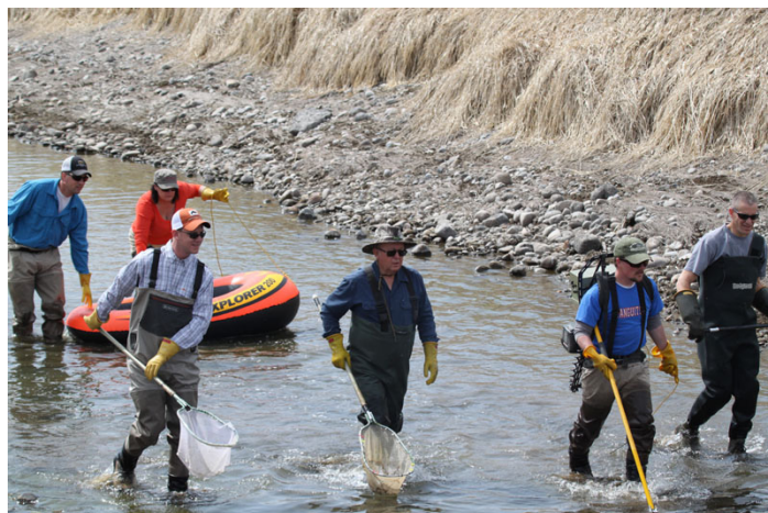
Volunteers turned out in early April to capture fish that swam into the Cross-cut Canal. Fish were caught using electrofishing and released back into the Henry's Fork below Chester Dam.

Thanks to Steve and Joette Lookabaugh for providing access to the river through their property and to all the volunteers, including the Upper Snake River Fly Fishers.