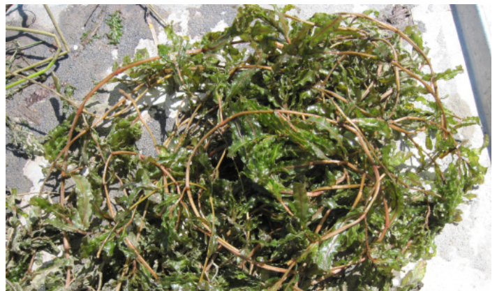
Curlyleaf pondweed crowds out other species, impedes water flow, and potentially impacts fish by altering oxygen levels.

Preventing this weed from taking hold is crucial. Please take care to ensure you do not spread this weed to other water bodies. The weed spreads through pieces of aquatic vegetation stuck to equipment. CLEAN, INSPECT, and DRY all boats, trailers, and fishing equipment when you are done fishing each day.