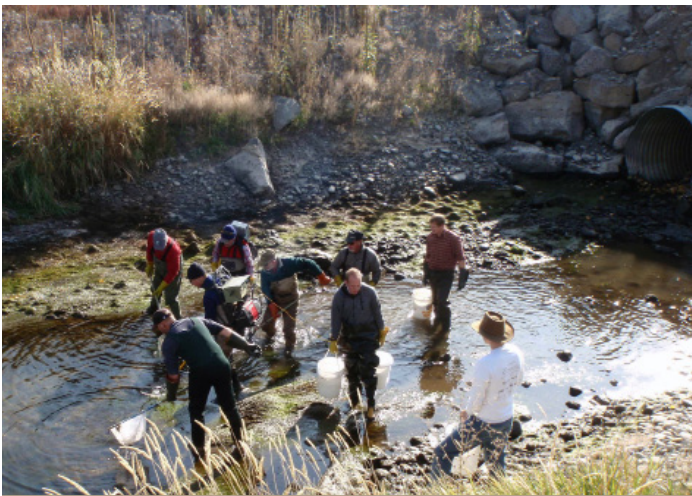
Volunteers salvaged fish from the Cross Cut Canal near Chester Dam in October. Since 2009, HFF and volunteers have returned 4,554 salmonids to the river from fish salvages in this canal.

HFF has salvaged the Cross Cut Canal every fall since 2009 and has returned 4,554 salmonids (whitefish and trout) to the river as a result. The number of fish salvaged represents just a small portion of the fish that enter the canal every year. The new fish screens will return fish back to the river in the future, which means more fish in the river for anglers.