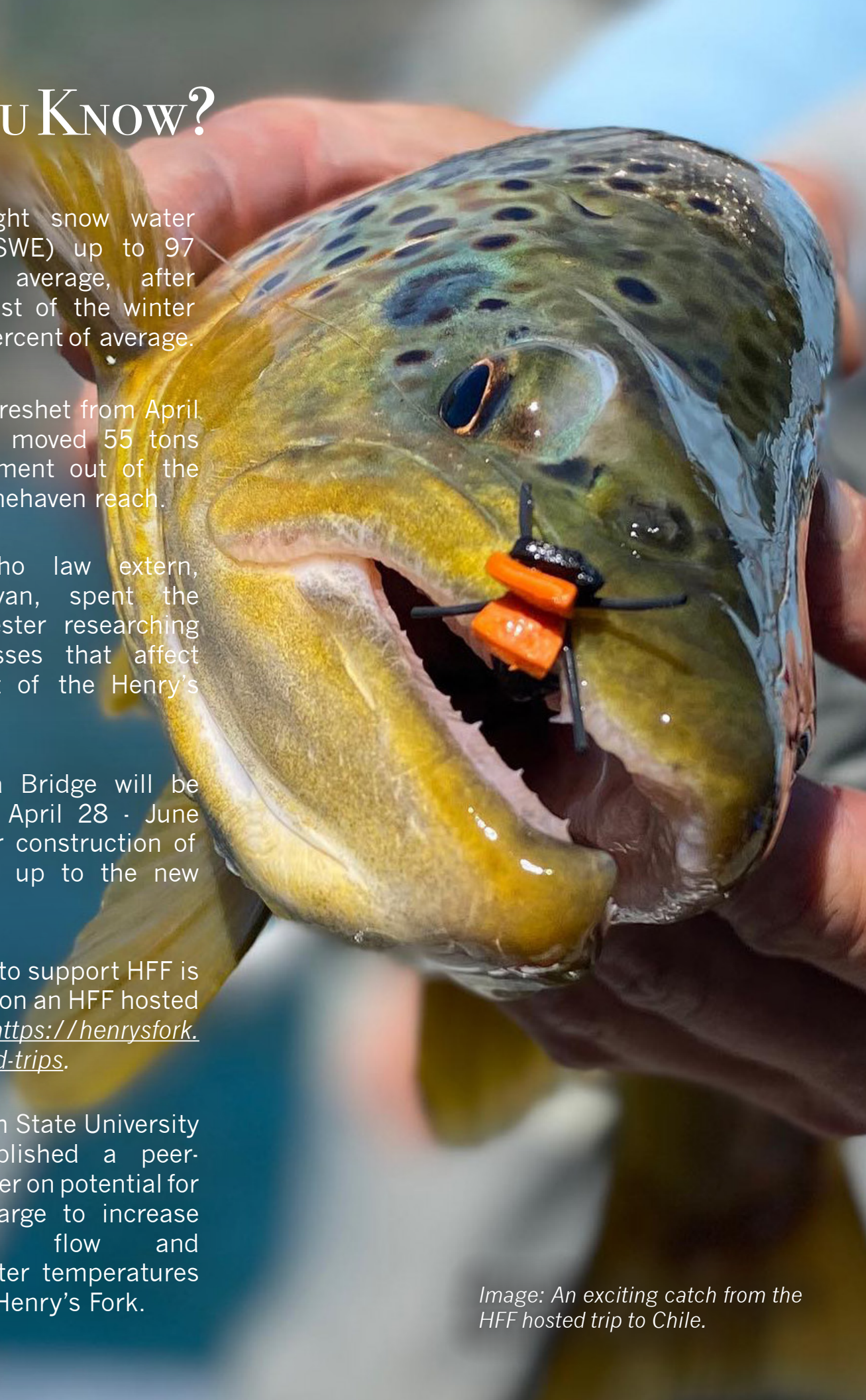
Image: An exciting catch from the HFF hosted trip to Chile.

HFF and Utah State University recently published a peer-reviewed paper on potential for aquifer recharge to increase summertime flow and decrease water temperatures in the lower Henry's Fork.